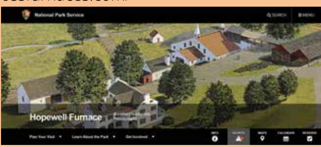
Hopewell Furnace National Historic Site https://www.nps.gov/hofu