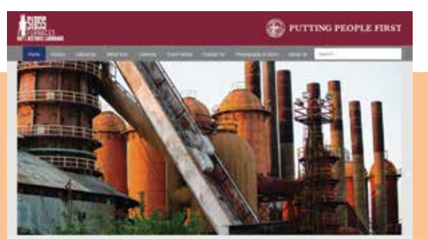
Sloss Furnaces National Historic Landmark https://www.slossfurnaces.com/