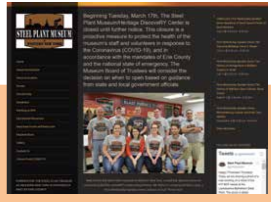
Steel Plant Museum of Western New York http://beta.steelplantmuseumwny.org